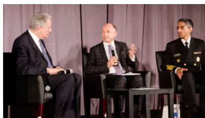
Keynote Speakers including US Surgeon General Dr. Vivek Murthy