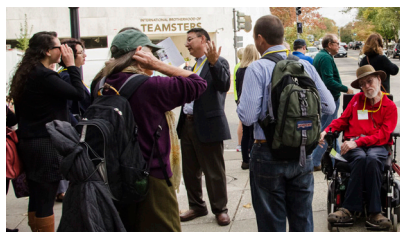
Walking workshops to explore walkable communities

A diverse group of over 500 participants from 42 states and representing 5 different countries